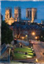
York Minster, York