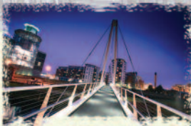
Millennium Bridge, Leeds