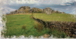
Almscliffe Crag, Weeton