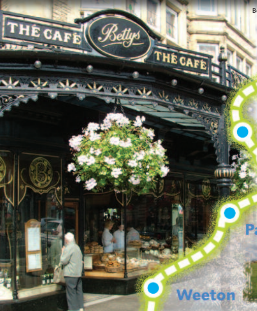
Bettys Café, Harrogate

Discover Harrogate and Knaresborough; both are stylish and enchanting and offer a great deal to enjoy. Elsewhere along the line there are interesting and quaint villages to discover, and don't forget to look out for the Red Kites flying overhead. Previously an endangered species, these beautiful birds have been successfully reintroduced into this part of Yorkshire and are now a regular sight around the line.